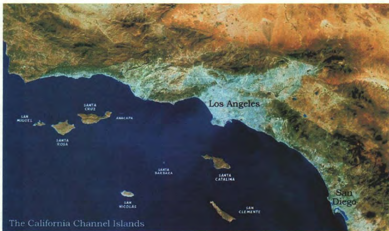
Figure 1. California Channel Islands located off the coast of Southern California, USA.

The Institute for Wildlife Studies (IWS), in cooperation with the United States Fish and Wildlife Service (FWS) and California Department of Fish and Game (CDF&G), initiated a program to reintroduce bald eagles to Santa Catalina Island, California (Fig. 1) in 1980. Between 1980 and 1986, 33 eagles were released on the island from hacking platforms (Garcelon 1988). Many of these birds matured and formed breeding pairs on the island, but all the eggs produced broke in the nest.