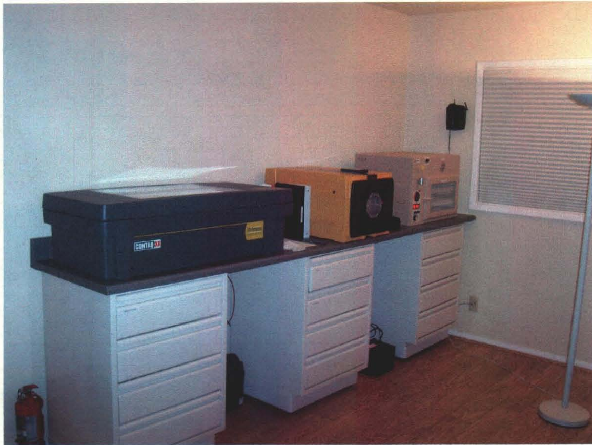
Figure 3. Incubation facility with Brinsea incubator (left), Brinsea hatcher (center), and Grumbach incubator (right).

eggs with warm, moist air, the X8 uses an air bladder inflated with warm air that rests on top of the eggs. This more closely mimics the conditions in a nest. Eggs were weighed and measured upon arrival in the facility so that we could estimate weight loss trends. Eggs should typically lose about 15% of their weight during the 35-day incubation period. If weight loss was above the predicted weight loss of a healthy bald eagle egg, then we covered portions of the egg below the aircell with Tegaderm. This reduced water loss through the shell, but allowed gas exchange. The Grumbach incubator, which can be set at higher humidity levels than the Brinsea, was used for eggs for which Tegaderm alone could not control water loss. The remaining eggs were placed in the Brinsea.