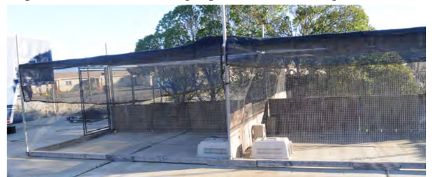
Figure 2. Set of 4 outdoor pens were used to allow fox patients to exercise prior to release.

We completed treatment and rehabilitation of two foxes captured in leg-hold traps in 2009, and these animals were released in 2010. One was an AC4 male originally admitted with a metatarsal fracture on 7 August 2009, who was released on 18 February 2010. The second was an AC4 male that was admitted on 1 November 2009 with hyperthermia and some soft tissue injuries. This animal was released on 20 February 2010. Animals recovering from fractures or long-term stays at the clinic were place in outdoor pens to retain their strength prior to release (Figure 2).