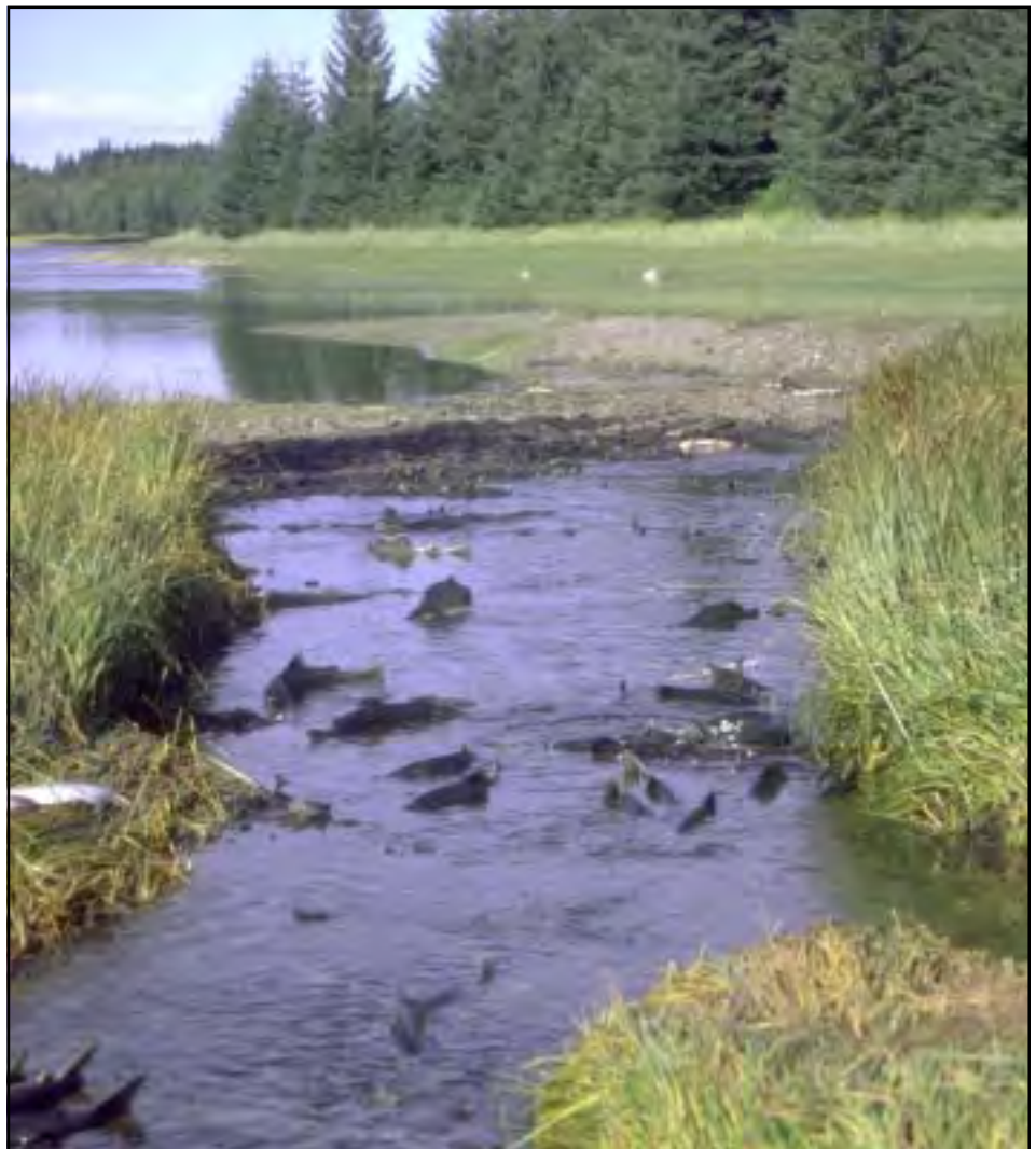
Opposite Page: Canoe Passage is one of more than 300 salmon streams protected through the Trustee Council's Habitat Protection Program. Habitat protection strongly benefits each of the human services, first by protecting the resources, but also by providing more public access for recreation, ensuring subsistence, and protecting spawning areas of wild salmon.

This publication was released by the Exxon Valdez Oil Spill Trustee Council and produced at a cost of $0.90 per copy.