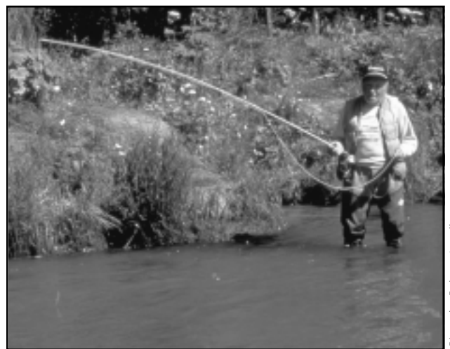
Recreation includes sport fishing, sport hunting, camping, boating, hiking and other active outdoor pursuits.