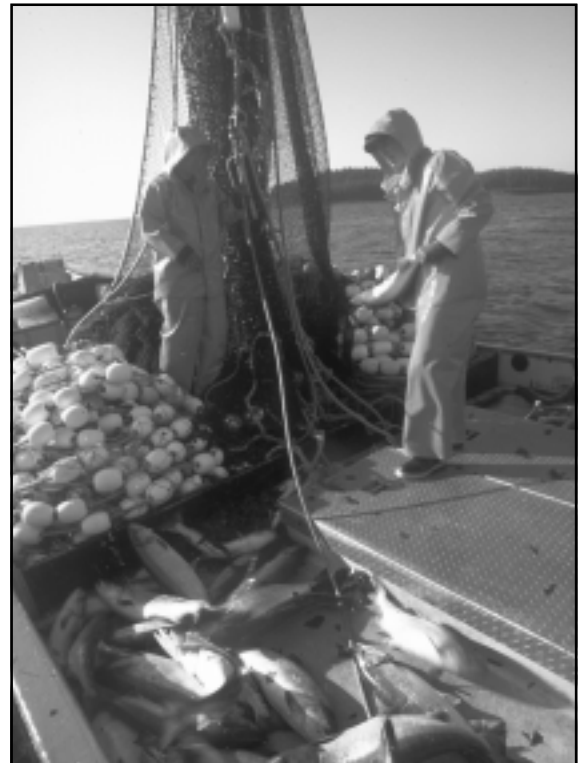
Recovery is underway but not complete for three of the injured resources that are commercially fished — pink salmon, sockeye salmon, and Pacific herring.

For a variety of reasons, as discussed below, income disruptions continue today, as evidenced by changes in average earnings, ex-vessel prices, and limited entry permit values. For example, for the period 1981-97, fishermen's average earnings in the Prince William Sound salmon seine fishery peaked in 1987-88, dropped in 1989 to 1984-85 levels, rebounded in 1990, hit a new low in 1992-93 (runs in 1992-93 were the lowest in 15 years), and since have hovered somewhat below the 1989 level. Average harvests have varied widely during this period, with the