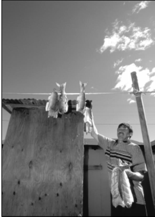
Concerns about food safety and effects on the traditional lifestyle have lessened over the years. But, concerns about resource availability remain.

Regarding resource availability, subsistence users continued to report scarcity of a number of important subsistence resources, including harbor seals, herring, clams, and crab. These observations are generally consistent with scientific studies funded by the Trustee Council that continue to find that some subsistence