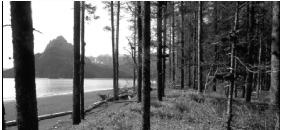
Kenai Fjords National Park

Among the affected areas were designated wilderness in the Katmai National Park, wilderness study areas in the Chugach National Forest and Kenai Fjords National Park, and Kachemak Bay Wilderness State