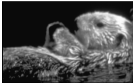
Sea Otter

Based on both aerial and boat surveys conducted in western Prince William Sound, there is statistically significant evidence of a population increase following the oil spill (1993-98). Observations by local residents bear out this general increase. However, within the most heavily oiled bays in the western sound, such as those on northern Knight Island, the aerial surveys indicate that recovery may not be complete.