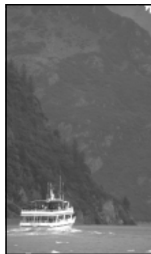
Wildlife tours in Kenai Fjords National Park

the spill and currently. Nearly all of the key informants with experience in Prince William Sound continued to report diminished wildlife sightings in the sound, particularly in heavily oiled areas such as around Knight Island. They reported seeing significantly fewer seabirds, killer whales, sea lions, seals, and sea otters since the spill, but also reported observing increases in the number of seabirds in the last couple of years. Key informants with experience along the outer Kenai coast also reported diminished sightings of sea-