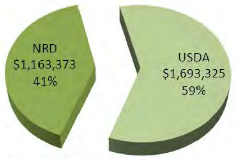
2012 Funds Used to Purchase Easements

Funds were provided to U.S. Department of Energy (USDOE) for enhancement restoration projects along Paddys Run, the triangle area, and the former silos area. See Trustee Resolution 13 for more information ( http://epa.ohio.gov/Portals/49/fernald%20files/fernaldpdfs/FernaldTrusteeResolution-13(FINAL).pdf ).