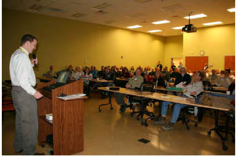
Ohio EPA explains the Paddys Run Conservation Project at a public meeting at the Fernald Preserve.

In February 2012 Ohio EPA gave a presentation on the status of the Paddys Run Conservation Project at the Forum for Natural Lands Management and Conservation sponsored by Green Umbrella. Approximately 100 people attended the conference that was held at the Fernald Preserve.