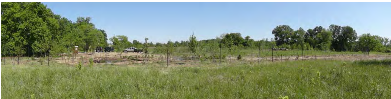
The Paddys Run tributary habitat enhancement was completed in 2012 with NRT funds.

Paddys Run Tributary Habitat Enhancement: This habitat enhancement created a quarter acre of vernal pools with adjacent forest on a seven acre project area at the Fernald Preserve along Paddys Run Road. An unused wet prairie was transformed into a wetland in order to become a breeding habitat for nearby ambystomid salamanders. The majority of fieldwork took place in April and May. Activities included grading, planting, fencing and irrigation. The total project cost approximately $150,000, about $54,000 less than originally estimated. Both plant material and the construction subcontract costs were less than the original estimates. The ability to adjust field planting kept the project on schedule, so costly weather delays were avoided.