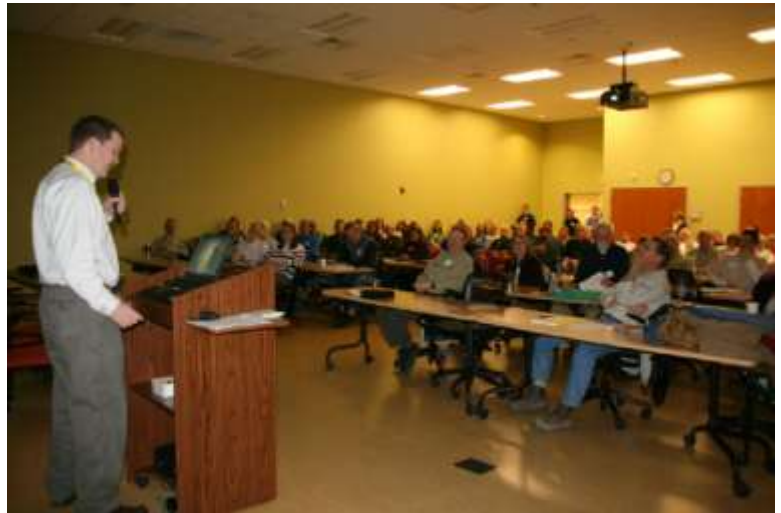
Ohio EPA explains the Paddys Run Conservation Project at a public meeting at the Fernald Preserve.

Prior to finalizing settlement of the NRD claims, several public meetings were held to gather community input on how the damages should be settled. In summer 2008, a 30 day public comment period was held on the partial consent decree. On July 31, 2008, a public meeting was held at the Crosby Township Senior Center to provide citizens an opportunity to learn more about the consent decree and restoration plan and to submit formal comments. In summer 2009, a 30 day public comment period was held on the Draft Natural Resource Funds Use Plan. A public meeting was held on July 8, 2009 at the Fernald Preserve to discuss the plan. The thirty day public comment period ended August 8, 2009. In November 2010, a Paddys Run