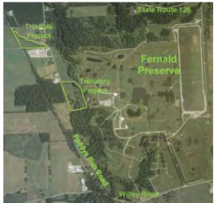
To the west of Paddys Run and the Fernald Preserve are two areas planned for habitat enhancement.

Paddys Run Tributary Habitat Enhancement: Plans were finalized for this habitat enhancement that will create a quarter acre of vernal pools with adjacent forest on a seven acre project area at the Fernald Preserve along Paddys Run Road. The goal is to transform a soggy area with prairie grasses into a wetland that would become a breeding habitat for nearby ambystomid salamanders. With the signing of Trustee Resolution 13, the April, 2011 Conceptual Design was approved in July, 2011. Field activities in 2011 include mowing, raking, and baling. An archeological field survey was conducted in December 2011 to comply with Section 106 of the National Historic Preservation Act. No eligible sites were found.