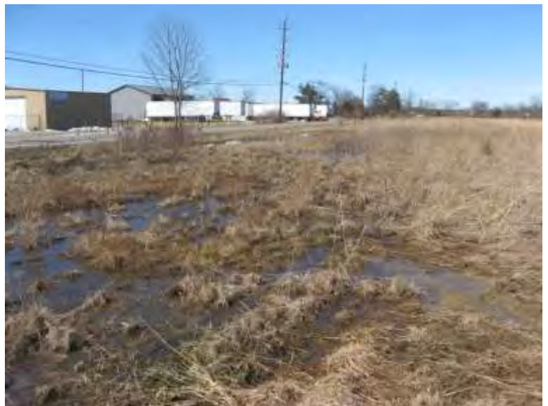
The west side of Fernald along Paddys Run is a possible area for habitat enhancement.