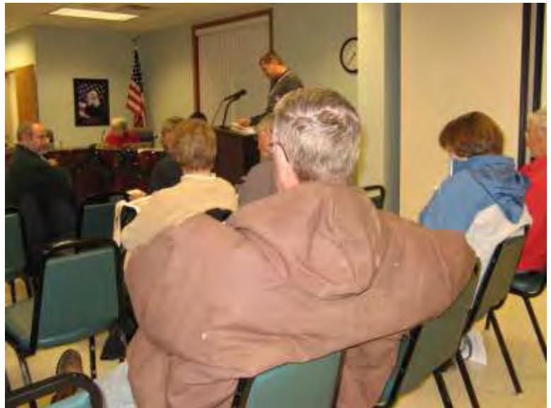
In 2010 Trustees introduced the Paddys Run Conservation Project at public meetings.

Prior to finalizing settlement of the NRD claims, several public meetings were held to gather public input. In summer 2008, a 30 day public comment period was held on the partial consent decree. On July 31, 2008, a public meeting was held at the Crosby Township Senior Center to provide citizens an opportunity to learn more about the consent decree and restoration plan, ask questions, and submit comments on the record. In summer 2009, a 30 day public comment period was held on the Draft Natural Resource Funds Use Plan. A public meeting was held on July 8, 2009 at the Fernald Preserve to discuss the plan. The thirty day public comment period ended August 8, 2009.