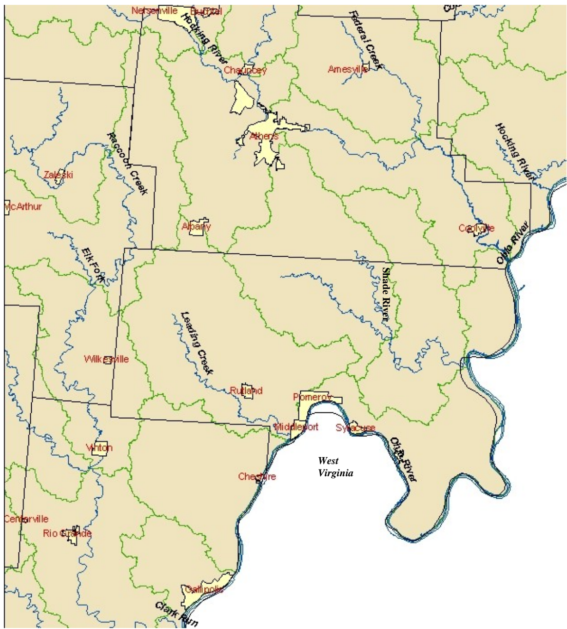
Figure 3: General Restoration Area Alternative C

The USFWS recognizes that basic ecological principles must be adhered to so as to achieve maximum benefit from restoration projects. However, projects that serve to restore ecological function to the Leading Creek EA area or those which are hydraulically connected to the Leading Creek EA area are preferred to projects located in upstream or adjacent watersheds. The USFWS expects ecological priorities for all restoration project categories under Alternative C will be influenced primarily by the following key factors: