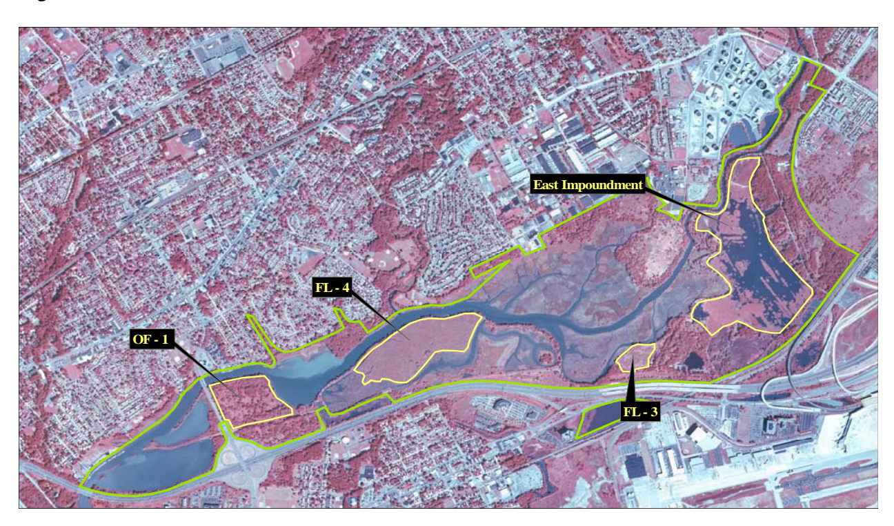
Figure 3. Restoration Alternatives for JHNWR.

The main component of this alternative would involve the removal of existing fill to restore tidal wetland, replicating the depth and slope of the original wetland's creek and mudflat (Woodlot 2002). Fill would be excavated down to the elevation of the adjacent tidal marsh. Daily tidal flows would be provided by excavating a narrow breach in the dike to allow free movement of tidal waters into and out of the restored basin. A concrete water control structure with a screwgate control would be installed in the breach to allow Refuge personnel to block flows into or out of the basin in the event of a catastrophic oil spill, to control invasive plant species, and to