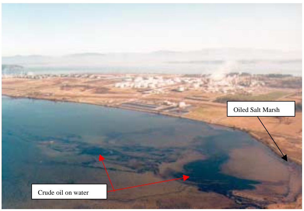
Figure 4. Oil slick in southern Fidalgo Bay on February 22, 1991. March Point and the Texaco Oil Refinery can be seen in the background. Dark patches and streamers of crude oil are visible throughout much of the southern portion of the bay. Salt marshes and intertidal beaches were heavily oiled in this part of the bay (lower right portion of the photo).