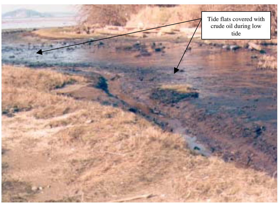
Figure 6. Most of the crude oil entered the bay from a drainage ditch at the north side of the trestle. Here dark patches of crude oil covers the intertidal beaches and tide flats near the entry point.