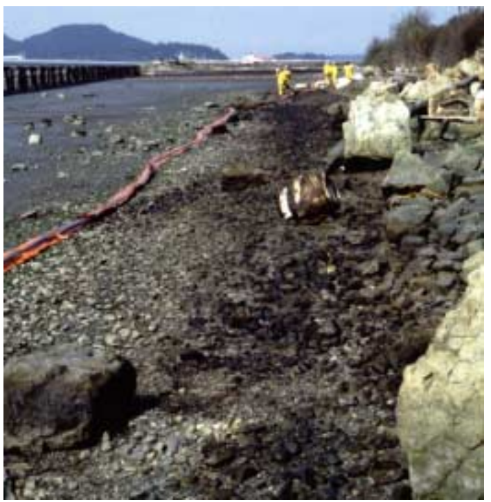
Figure 7. Oil on upper intertidal beaches of March Point. Beach cleanup crews are working in the background. Portions of this beach are spawning areas for surf smelt.