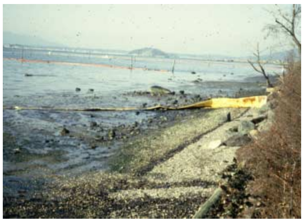
Figure 8 . Oiled shoreline on March Point following the Feb 22, 1991 spill. The oiled beaches in this photograph are smelt spawning beaches.