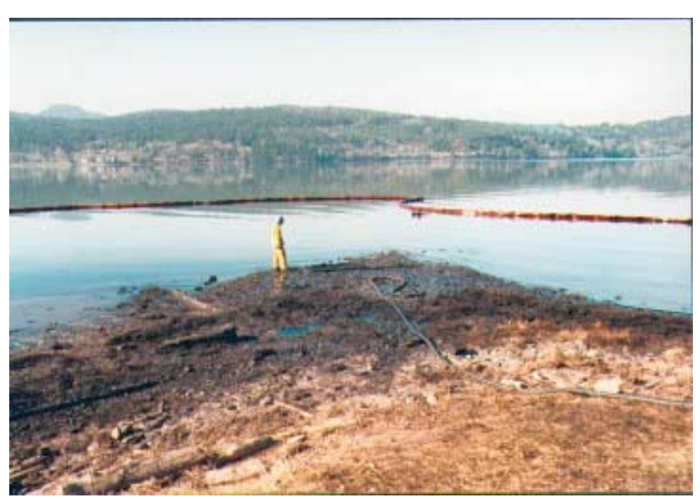
Figure 11. Oiled intertidal shoreline in Fidalgo Bay.