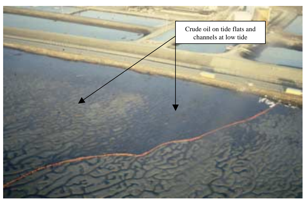
Figure 5. Oil on tide flats and in drainage channels during low tide in southern Fidalgo Bay following the February 22, 1991 oil spill. Oil concentrated on the tide flats and flowed into shallow sub-tidal habitats via drainage channels during low tides.