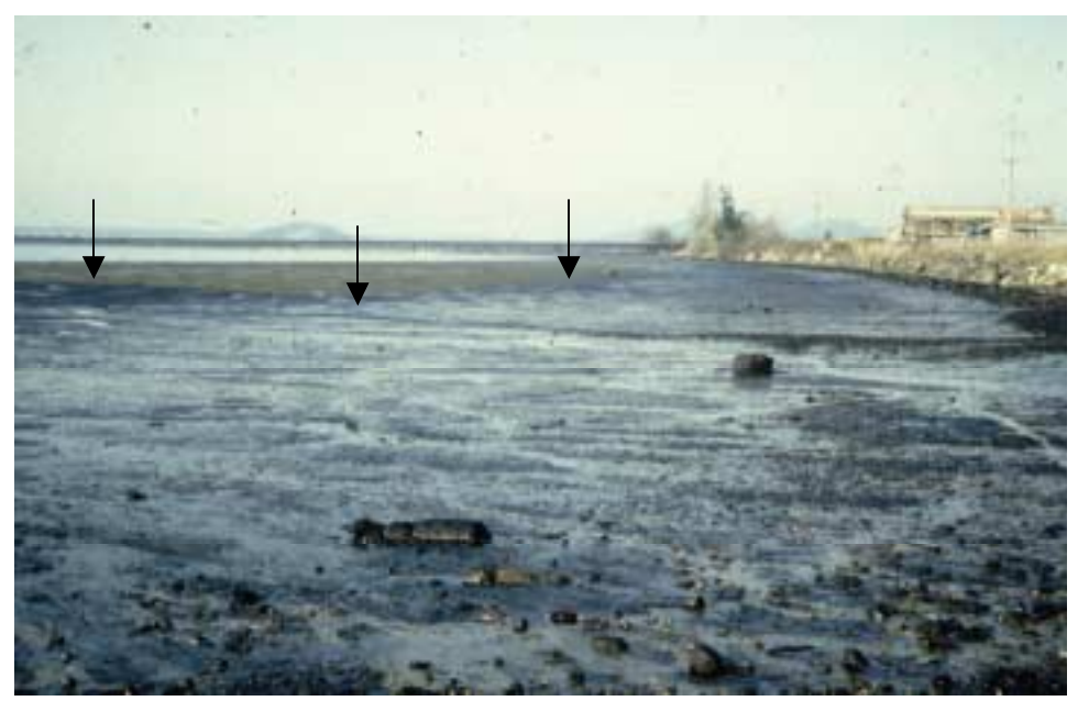
Figure 10 . Oiled intertidal mud and sand flats in south Fidalgo Bay during low tide following the February 22, 1991 spill. The arrows indicate the outer edge of visible oil on the exposed tide flats. Moderate to heavy oil was present on the tide flats from the arrows to the beach in this area of the bay.