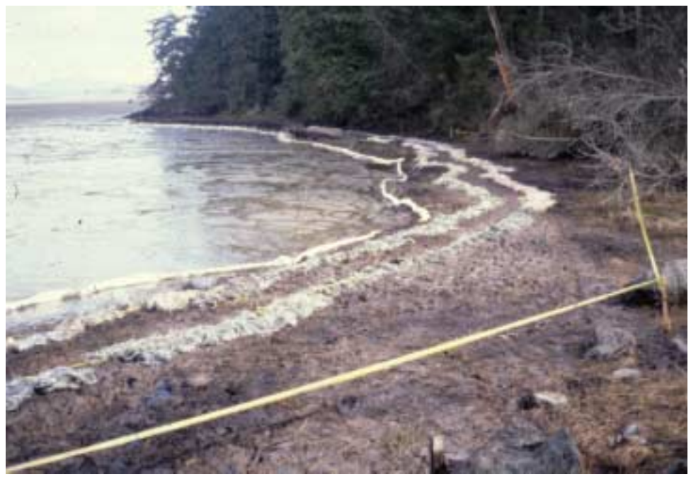
Figure 12. Oiled salt marsh habitat along southern shoreline of Fidalgo Bay. Strings of oil absorbent "pom-poms" have been placed along the shore to collect oil.