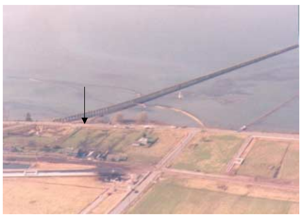
Figure 2. Containment booms and an oil skimmer attempt to contain and collect crude oil near the spill source in Fidalgo bay following the February 22, 1991 spill. Most of the oil entered the bay from a drainage culvert north of the railroad trestle (arrow).