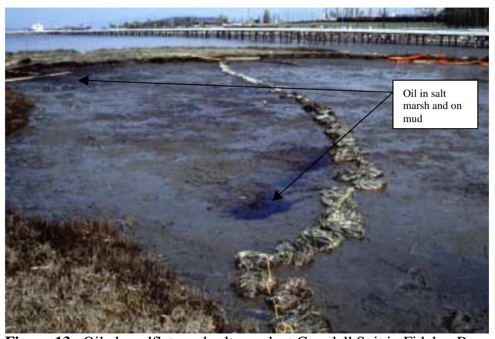
Figure 13. Oiled mudflats and salt marsh at Crandall Spit in Fidalgo Bay.