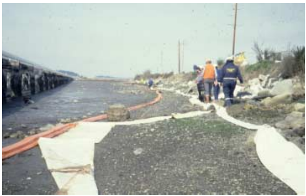
Figure 9 . Shoreline assessment teams surveying oiled beaches on March Point following the February 22, 1991 spill. The oiled beaches in this photograph are used by surf smelt for spawning.