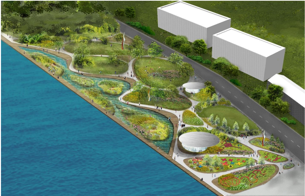
Artist rendition of a potential restoration project outcome.

This Draft ERP/EA evaluates the potential impacts of proposed early restoration Project proposals for park options in East Newark, New Jersey within the immediate vicinity of the Passaic River, for public review and comment, prior to the publication of a Final ERP/EA. The Federal Trustees may supplement the information provided in this Draft ERP/EA, if appropriate.