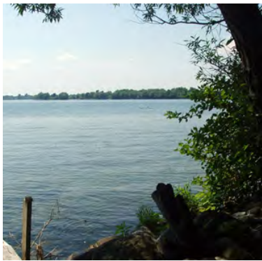
St. Lawrence River from Thompson Island.

Polychlorinated biphenyls (PCBs), polyaromatic hydrocarbons (PAHs), aluminum, fluoride and cyanide.