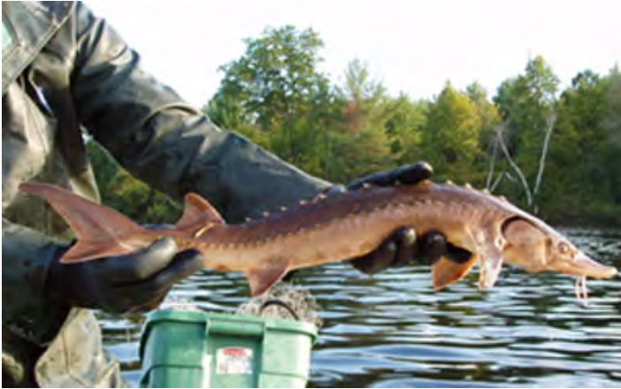
Lake sturgeon stocking and spawning habitat restoration in St. Lawrence River and tributaries: Salmon, Grasse, St. Regis and Raquette Rivers.

Compensation for these impacts will be provided by installing or upgrading five boat launches and fishing piers in the Massena area: Grasse River (Madrid, Rte. 37, Rte. 131) and Raquette River (Massena Springs, Massena).