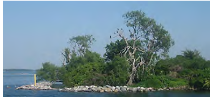
Dickerson Island predator control for Great Blue Heron restoration.