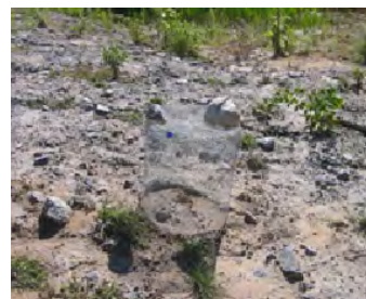
Acquisition of 337 acres at Coles Creek provides nesting habitat for Blandings turtles.