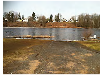
Proposed boat launch and fishing pier site on the upper Grasse River at Madrid.