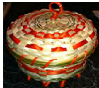
Fund Akwesasne programs that work to regenerate traditional cultural practices.