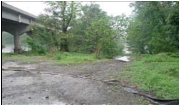
Treichler’s Bridge access point (pictured above) is currently a popular informal Lehigh River access area. The site will be improved with a new parking lot, cement boat ramp with vehicle access, and site design to tie-in with the newly developed Delaware and Lehigh National Heritage Corridor Trail and Trailhead. When complete, the site will be similar to the recently completed Lehigh Gap access area (pictured below).

Walnutport Borough, the Conservancy and the state Department of Conservation and Natural Resources also are providing funding to the project.