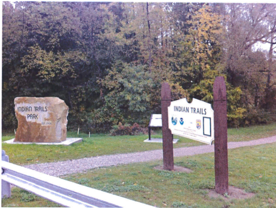
Photo 18: New Signs and Railing to Prevent Vehicle Traffic in Park