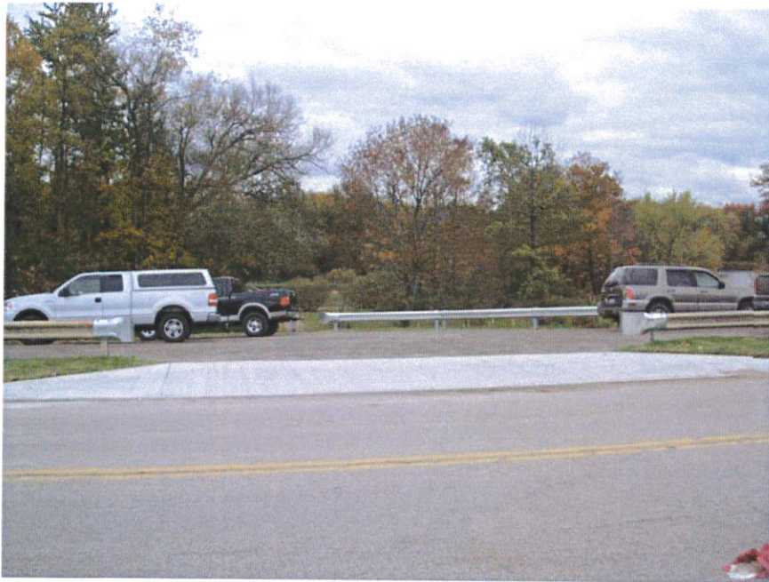
Photo 17: New Entrance Apron, Stormwater Catch Basin and Additional Space for Parking