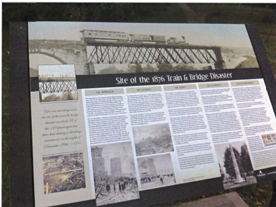
Photo 20: Sign explaining historical significance of Ashtabula Train & Bridge Disaster which occurred at bridge located at end of Natural Walking Trail.