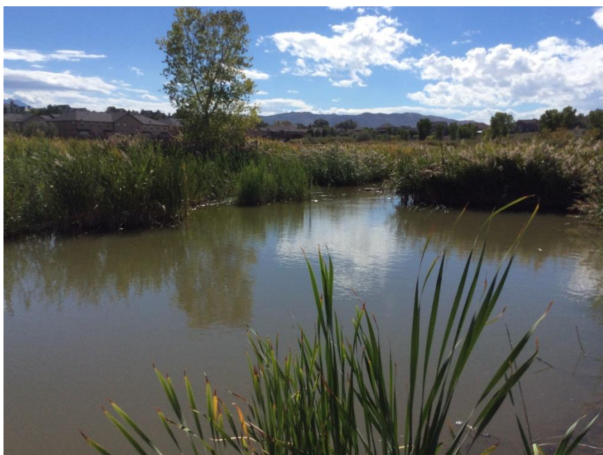
Figure 1. (Above) Photos of the three representative sites for the 9/20/2022 RSRA survey of Willow Creek.