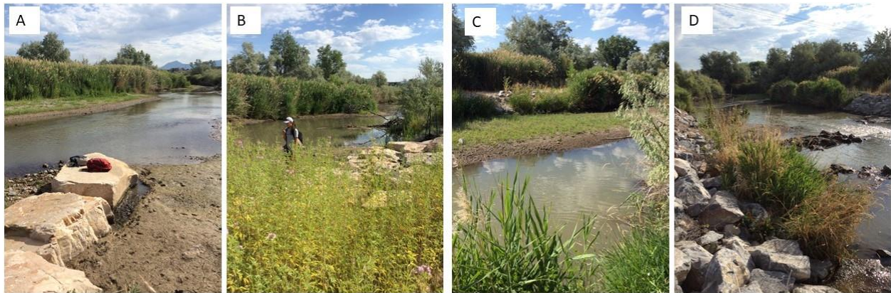
Figure 3. Photos of representative sites 1,2, and 3 (A, B, C respectively) as well as the upstream extent of the survey reach (D). Panel D provides perspective on the degree of channel entrenchment relative to the historic floodplain. Riprap stabilizing the bank is part of ongoing restoration activities. Russian Olive and large patches of Phragmites dominate the riparian plant community, although some cottonwood, willow and native herbaceous plants are present as well.

The partial Big Bend survey was conducted on July 8, 2021. Results are summarized in Table 2, and site photos are shown in Figure 3. As seen in the table, several indicators are missing, but each of the 5 categories are represented by existing measurements to some degree. The water quality indicator score had low points due to the lack of channel shading (2 out of 5 pts). The Hydro-geomorphology score was 3.25 with a notable lack of beaver activity and extremely incised banks. The Fish & Aquatic Habitat score was 3.5, averaged from two indicators (cobble embeddedness and aquatic invertebrate diversity). The Riparian Vegetation score (2.5 out of 5) lost points due to the dominance of non-native herbaceous and woody vegetation. The Terrestrial Vegetation score was 2.75 with points lost for low density of upper canopy trees. Over time, restoration activities including structural additions to the channel and re-vegetating the riparian zone will likely improve the overall habitat and RSRA score of this site.