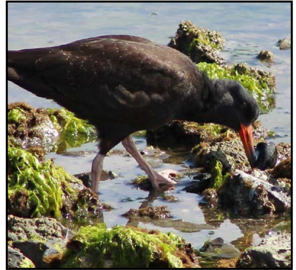
In June 2014, Black Oystercatchers nested on Aramburu Island, the first breeding record for this species in Richardson Bay.