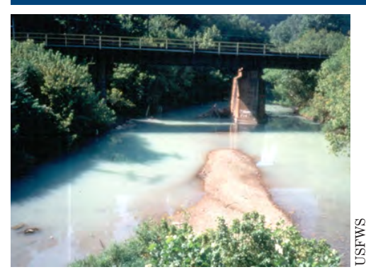
The Certus Spill on the Clinch River.

Clinch River supported a wide array of organisms, including three federally listed mussel species. The Octocure 554-revised spill eliminated, or nearly eliminated, entire biotic communities within the seven mile impacted stretch of the Clinch River.