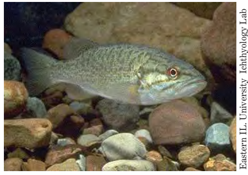
Species like smallmouth bass benefit from restoration efforts on the river.