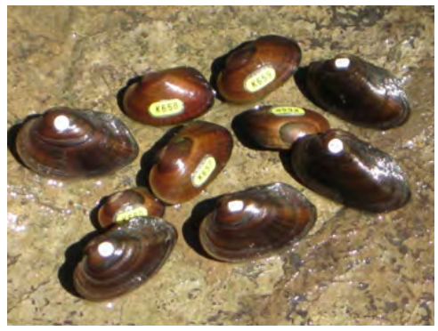
Tagged freshwater mussels; the endangered purple bean.

Freshwater mussels are a valuable part of the river ecosystem. They filter water, improving the aquatic habitat for all species; stabilize river and stream bottoms; and are a food source for other fish and wildlife. Restoring mussel populations improves the quality of habitat for fish and other aquatic wildlife.