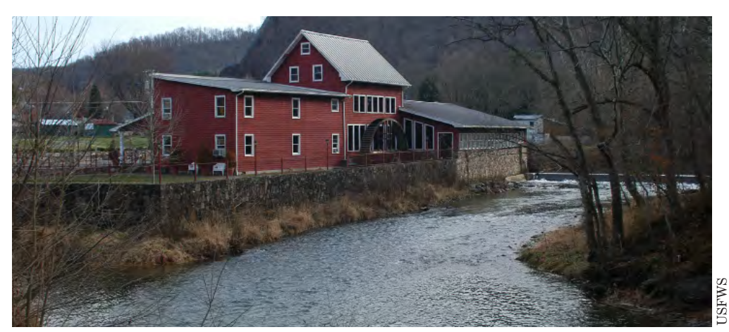
The Old Mill on the Clinch River located at Cedar Bluff.